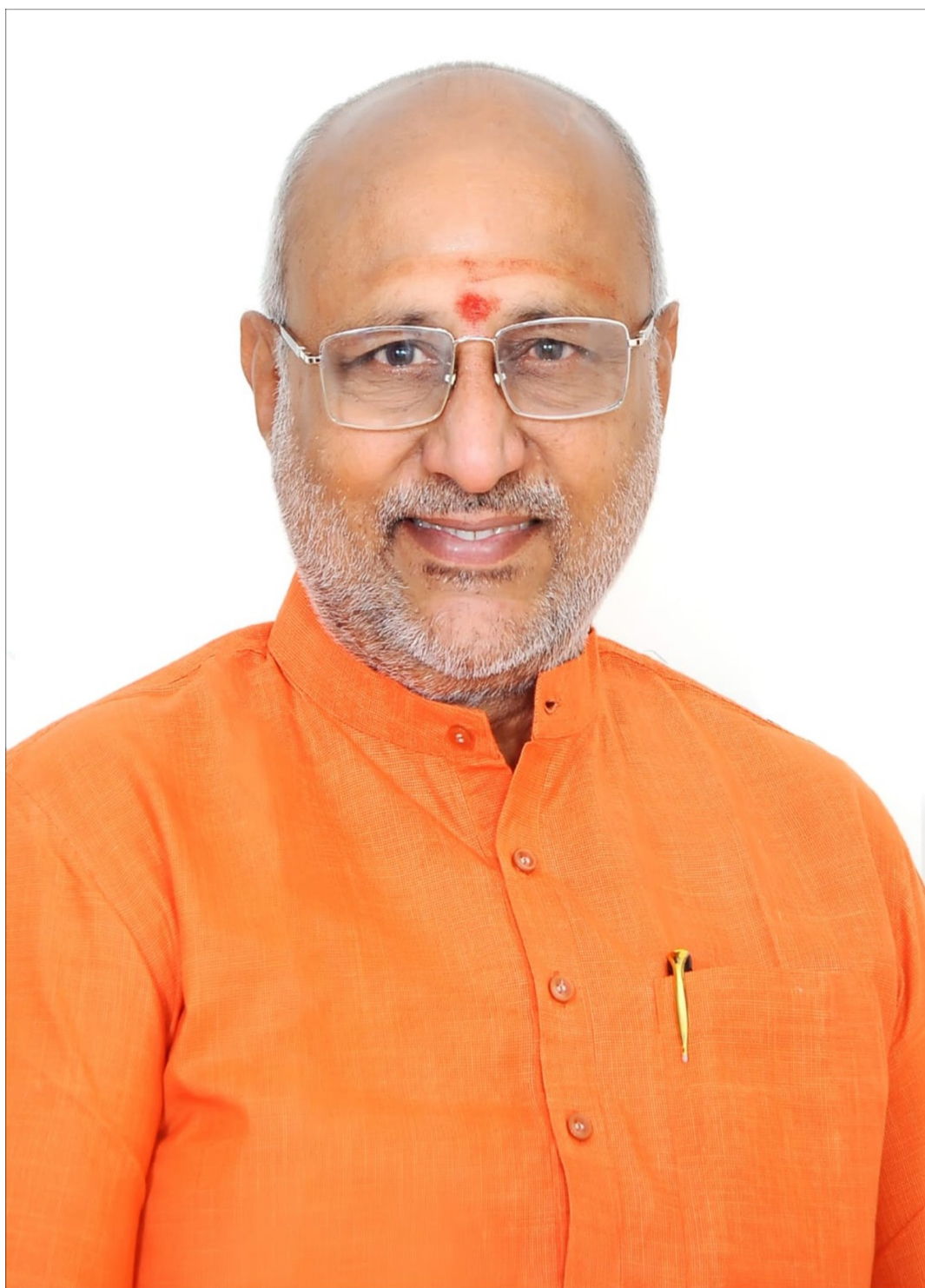
Hon'ble Shri C.P. Radhakrishnan, Vice President of India and Chancellor, Panjab University, Chandigarh